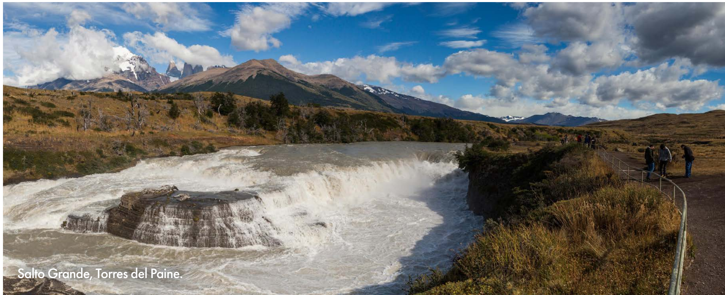
Salto Grande, Torres del Paine.