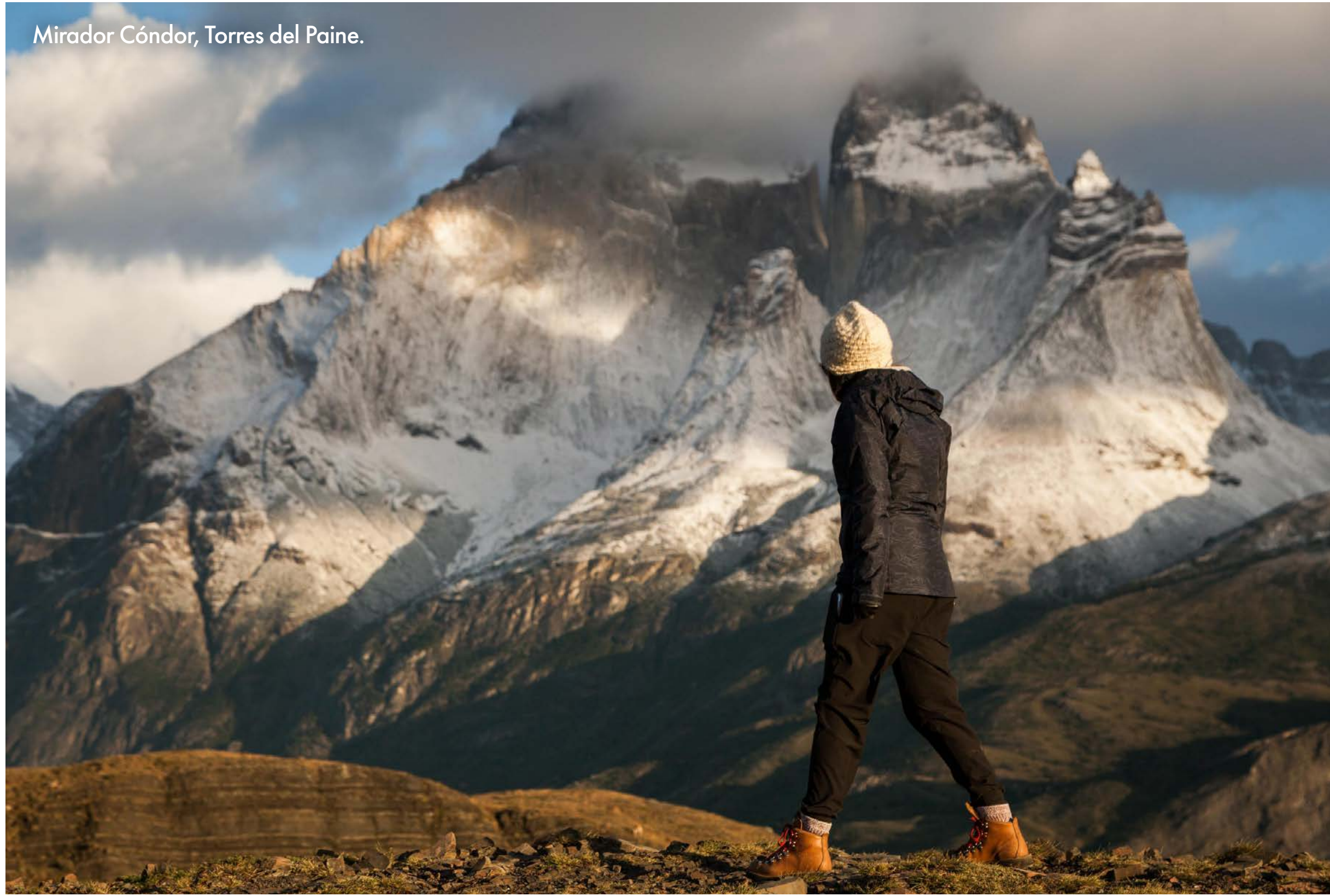
Mirador Cóndor, Torres del Paine.