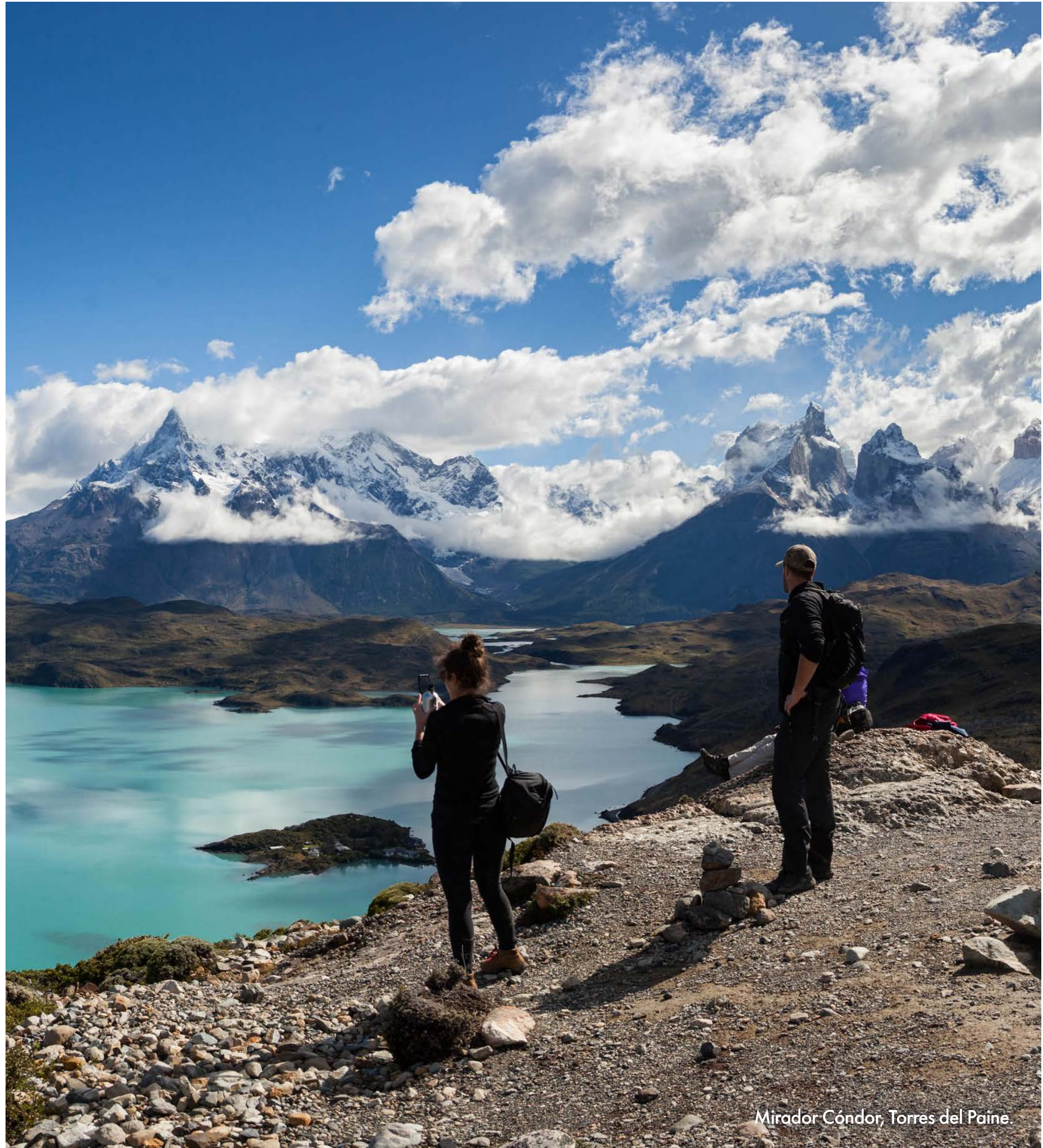
Mirador Cóndor, Torres del Paine.